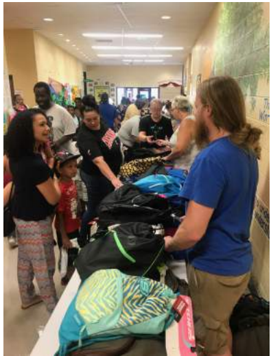
Vineyard West Church volunteers passing outfree backpacks filled with school supplies at Cheviot School.